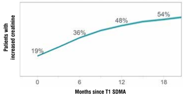
Figure 3. Mildly increased SDMA concentrations that persist often precede an increased creatinine